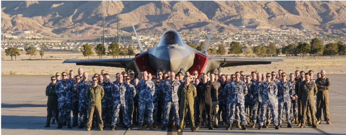
Above : Aviators from 3SQN with an F-35 Lightning II at Air Force Base Nellis, Nevada. USA.

From - February 6 2025 AirForce Vol. 67 No.1 February 6 2025